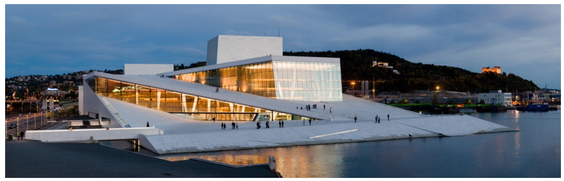
Oslos new Opera hall

In order to discuss and decide the further path of the new ISSAI 4000 Compliance Audit Standard of INTOSAI, an annual committee meeting will, as always take place. In 2014 the CAS Chair and secretariat are happy to announce that we will be welcoming you all to our capital Oslo, Norway. Further information on the meeting will be provided when the time approaches.