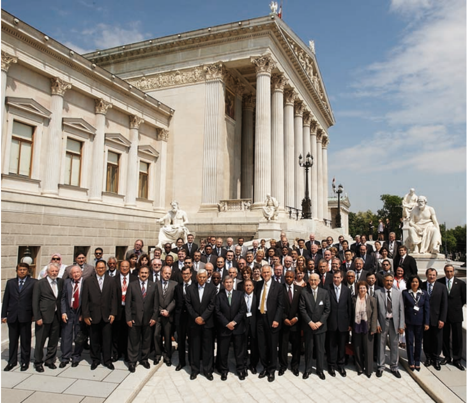
Participants of the Conference on Strengthening External Public Auditing in INTOSAI Regions 26 – 27 May 2010, Vienna